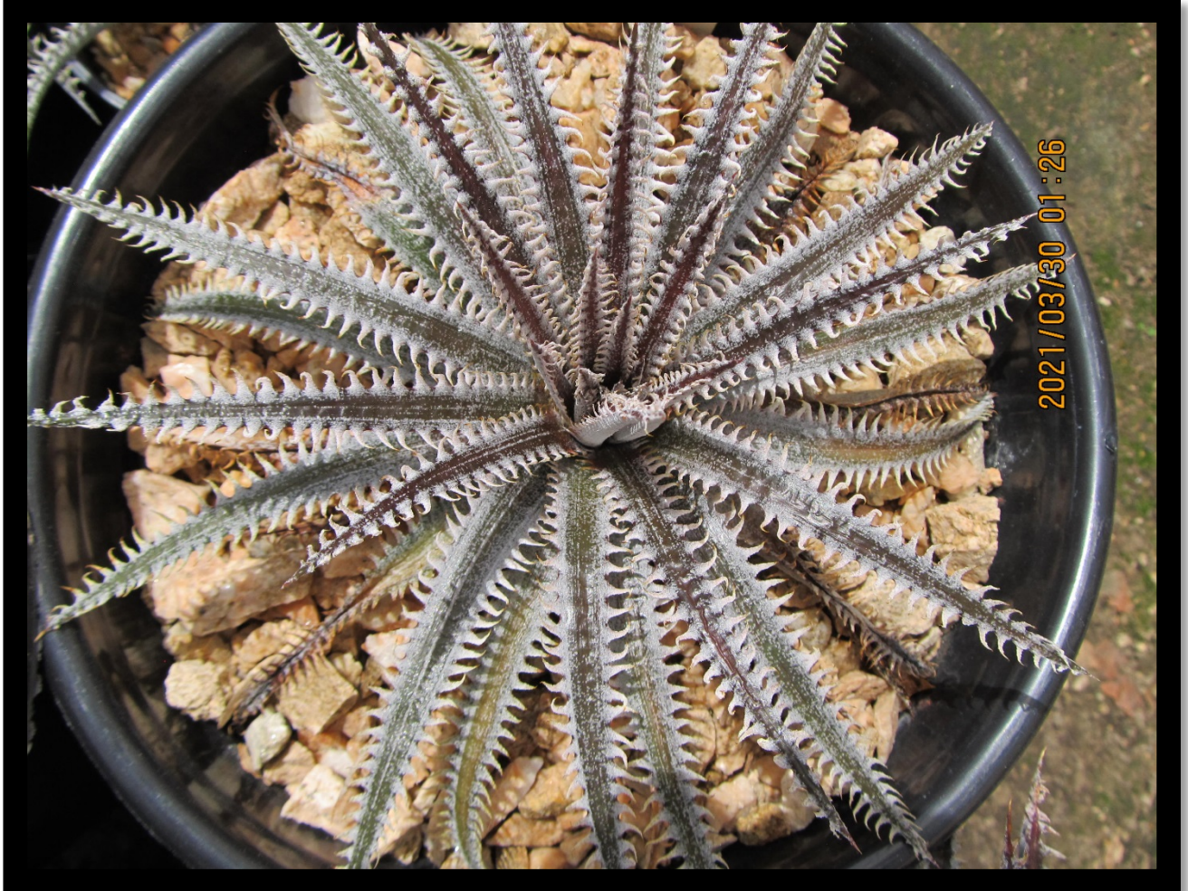
Dyckia hybrid – Tracking Code 12D Plant and Photo submitted by Bryan Chan