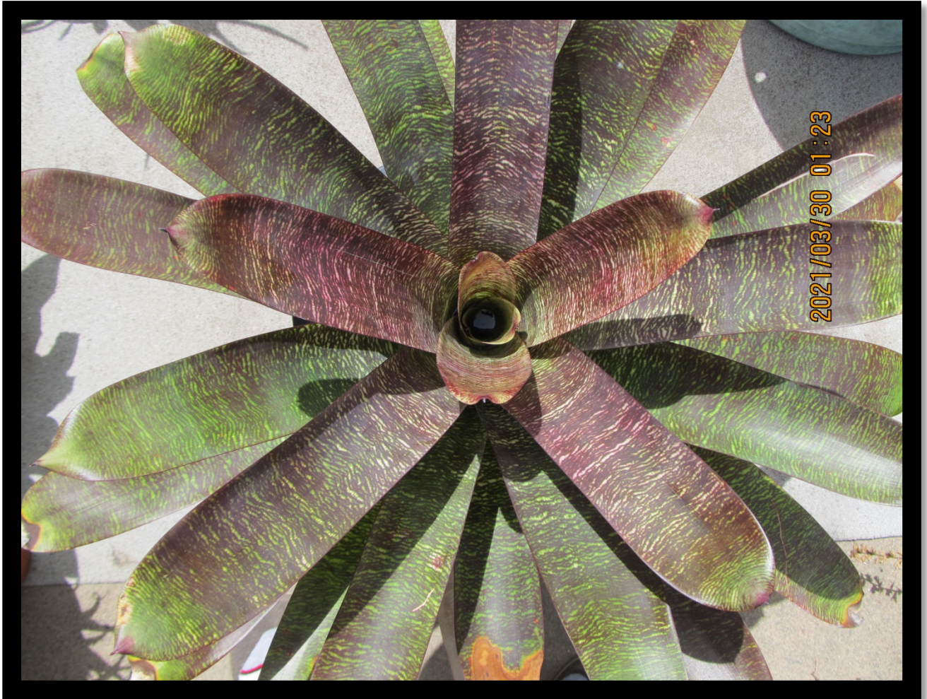
Vriesia "Pahoa Beauty" x fosteriana Plant and Photo submitted by Bryan Chan